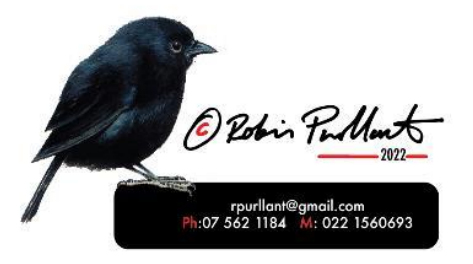
For more information please contact me.

This Workshop is limited to 12 members. There will be one-on-one guidance during every session.