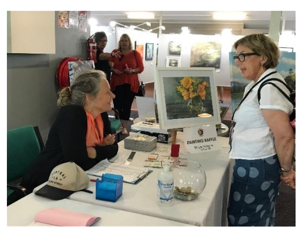
Another eager visitor being welcomed