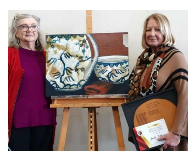
Richard Perkins Memorial Trophy Best Still Life

The group gathered in the rather chilly venue were enthusiastic and there were quite a few of the "new" members taking out the prizes, which was great to see.