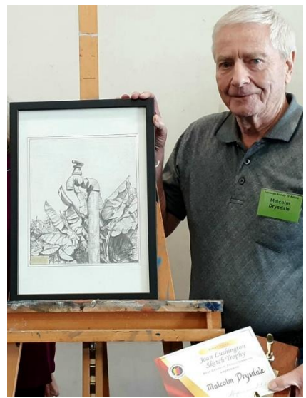
Joan Lushington Sketch Trophy (A4 Paper & Graphite Pencil)