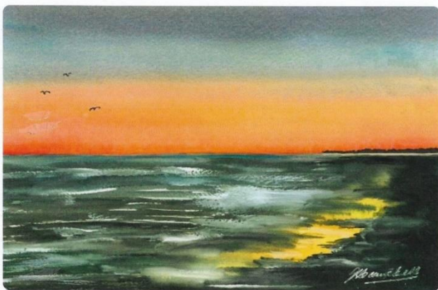
Papamoa Beach at Sunset

I love to capture rural scenes, old buildings, iconic landmarks and letterboxes.