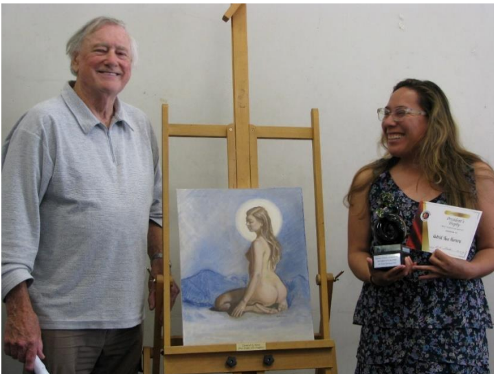
President's Trophy: Best Emerging Artist - "What's Above Me" theme