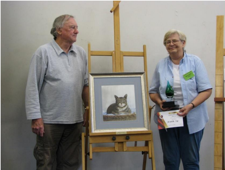
Carter Brothers Award: Best Watercolour (Tube, cake or pencil)