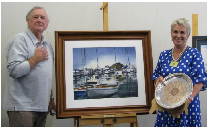
Marge Martin Salver: Tauranga Scene