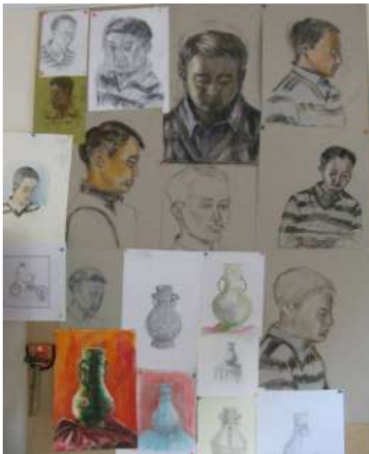
Wednesday Portraiture Group work at top, 7 September and Monday Drawing for Pleasure Group work at bottom.

Please note that each workshop begins at 9.30am. Enrolment Sheets are in the Foyer of the Art Rooms