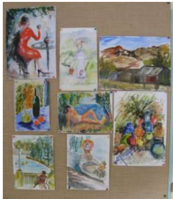
Wednesday morning 16 September My Favourite Artist – in the style of N Z Impressionist, Evelyn Page