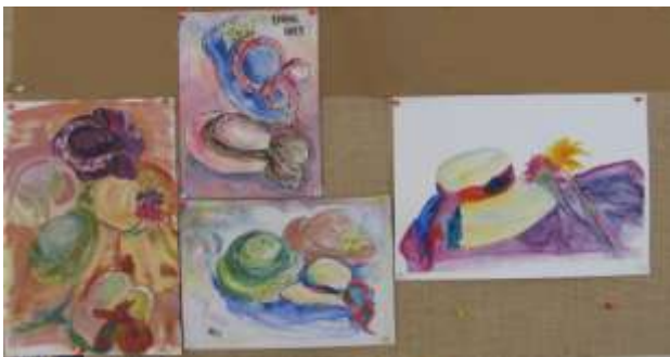
Wednesday morning 9 September Still Life – Spring Fashion hats