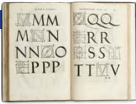
"Of the Just Shaping of Letters" By Albrecht Dürer, 1525