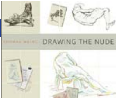
Published by A and C Black, London