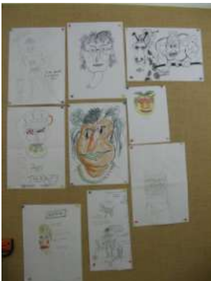
Left: Tuesday evening art therapy!