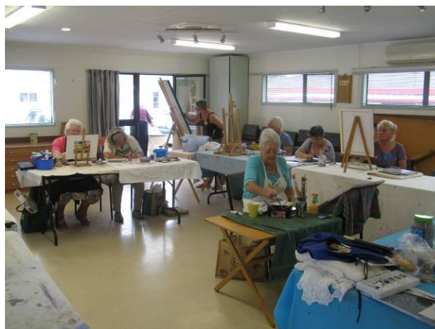
Tuesday morning session

In short, it's a pop-up art gallery, free for local amateur artists. It will debut at the 2017 Tauranga Art Festival. The gallery will be situated in Red Square for the duration and then move to the Rotorua City Focus from 16-28 November. This will be open to all amateur artists from within the Bay of Plenty Region and a great opportunity to exhibit their work.